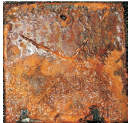
Figure #3: Conventional solvent based epoxy primer and urethane topcoat system. This sample was used as benchmark for a complete primer/topcoat system. The system tested is a widely used commercial system for industrial maintenance applications.

Figure #2: Solvent free two component primer (Standard). This sample was used as a control to determine the corrosion resistance of a P-180D type of product with no anti-corrosion additives employed.