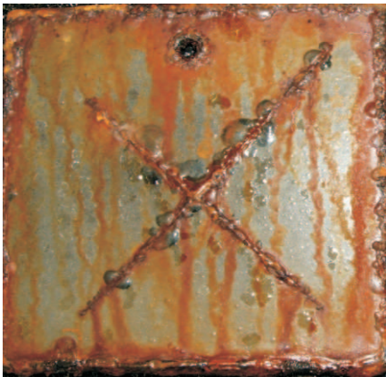
Figure #2: Solvent free two component primer (Standard). This sample was used as a control to determine the corrosion resistance of a P-180D type of product with no anti-corrosion additives employed.

Figure #1: Primer P-180D no topcoat. Used to evaluate corrosion resistance of P-180D on its own.